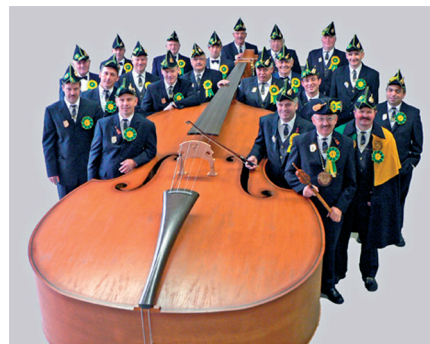
„Gige“ and Carnival guild members

Doppleschwand is part of the UNESCO biosphere Entlebuch