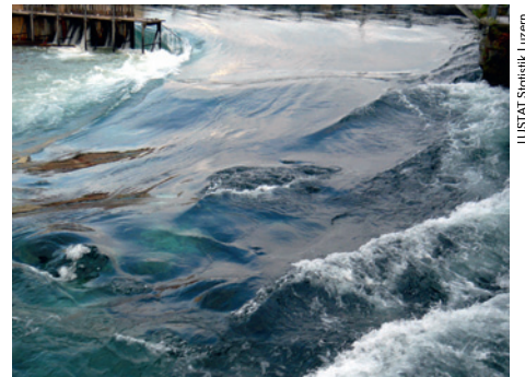
LUSTAT Statistik Luzern

The small dam located in the city of Lucerne regulates the „Reuss“ river