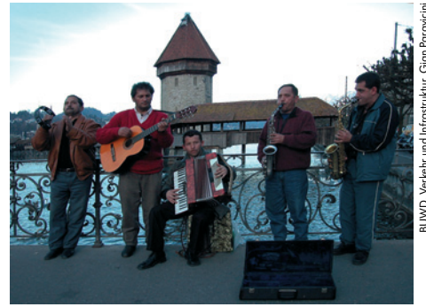
BUWD, Verkehr und Infrastruktur, Gian Paravicini