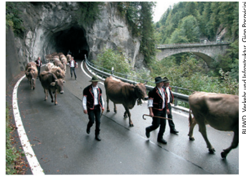
BUWD, Verkehr und Infrastruktur, Gian Paravicini

Traditional descent from the summer pastures from Flühli to Schüpfheim passing the Lamb Canyon